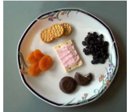
This plate of apricots, raisins, and various cookies equals 500 Calories