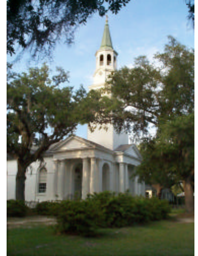
St. James Episcopal Church

HEALTH CONFERENCES are a powerful means to find a Biblical solution to the very serious health problems of diabetes, obesity, high blood pressure, and high blood cholesterol. Saint James Episcopal Church and Fort Johnson Baptist Church held morning programs for their congregations during the month of May. Call (843) 792-3046 to schedule your church. It is an important way to provide health education to the people of your community. Become God's Ambassador for Health!