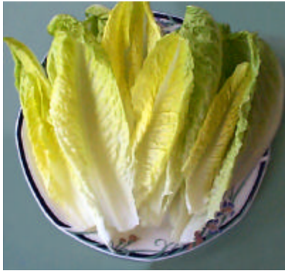
25 Calories of Lettuce