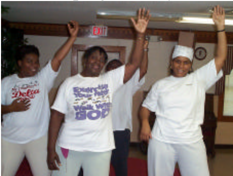
First Baptist Folks Exercising

CHANGE FROM THE INSIDE OUT. How many times have you begun an exercise program only to have it fizzle out with frustration and few results? Why do so many people quit their exercise programs, not just once, but over and over again? The underlying problem is most people focus too much on changing their body shape through diet and exercise without changing their mental and emotional framework as well. If you want to change your body you must first change your mind. A positive mindset produces positive changes. Begin to see yourself as a strong and healthy individual. If you see yourself as being “out of shape” you’ll continue to remain “out of shape.” Instead of trying to do everything on your own, ask God to be your training partner. He will help you change from the inside out instead of the outside in. Try it...the results will amaze you!