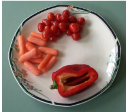
Plate of carrots, tomatoes, & bell pepper equals 75 Calories